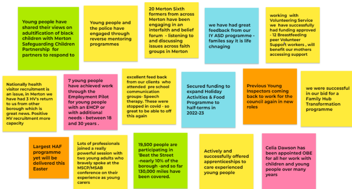
Figure 1: JamBoard of good news and successes

The Children's Trust met on 28 th March for a very positive annual review. Kicking off with a collaborative reflection on the good news so far, it was clear that there have been some incredible outcomes and achievements made across all outcome areas. There continues to be a deep appreciation for the youth inclusion and participation in Merton; whilst the Merton Story indicates challenges we face from ageing populations to the East – West divide in the Borough, highlighting key areas to work on. Thank you to the Young Inspectors, Outcome Champions, and all those involved in developing the workstreams.