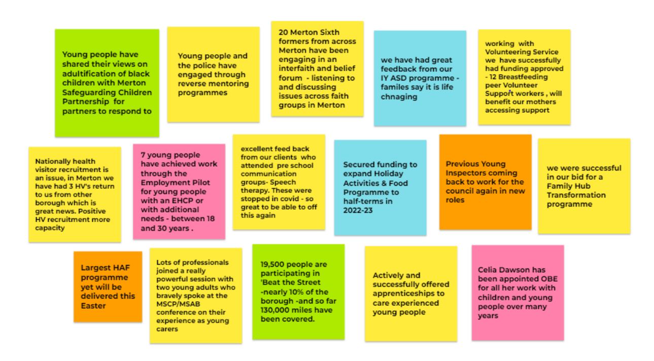
Figure 1: JamBoard of good news and successes

The Children's Trust met on 28<sup>th</sup> March for a very positive annual review. Kicking off with a collaborative reflection on the good news so far, it was clear that there have been some incredible outcomes and achievements made across all outcome areas. There continues to be a deep appreciation for the youth inclusion and participation in Merton; whilst the Merton Story indicates challenges we face from ageing populations to the East – West divide in the Borough, highlighting key areas to work on. Thank you to the Young Inspectors, Outcome Champions, and all those involved in developing the workstreams.